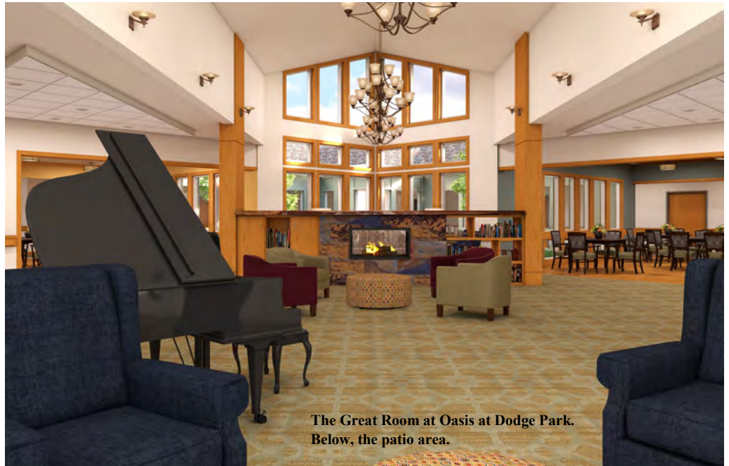
The Great Room at Oasis at Dodge Park. Below, the patio area.